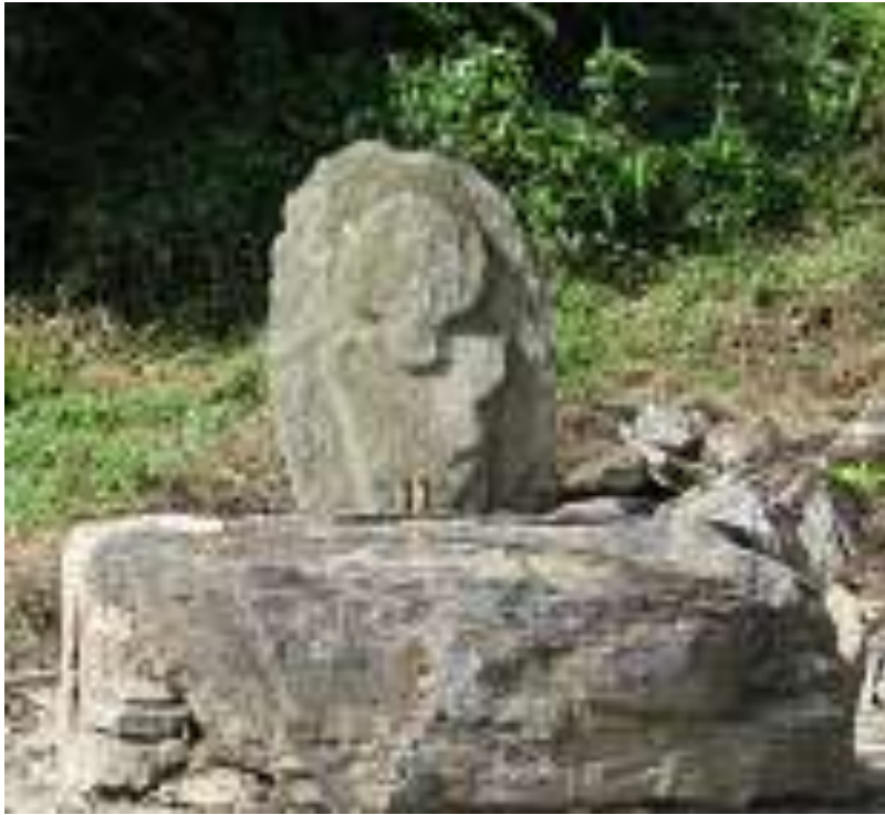
The guardian God

lika`e means worship visiting kiso`ili means sharing the giftthe