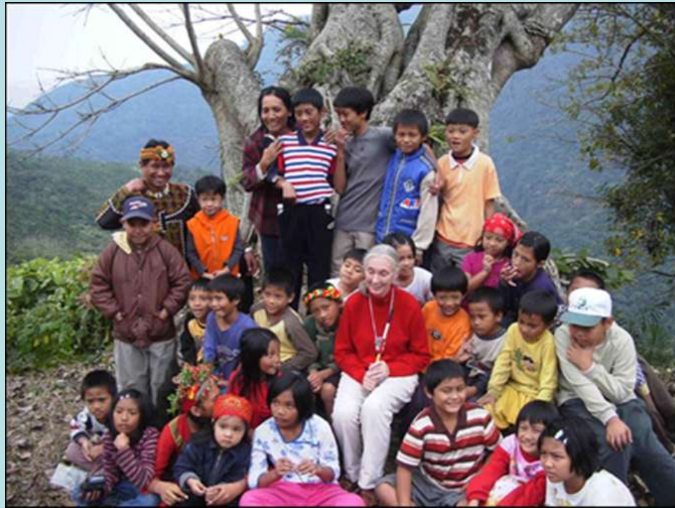
Jane Goodall 2002