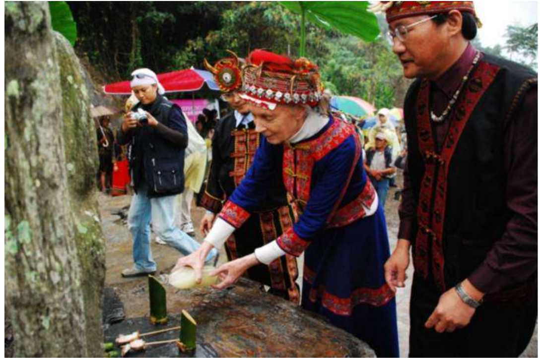
Worship with beetle nut & wine